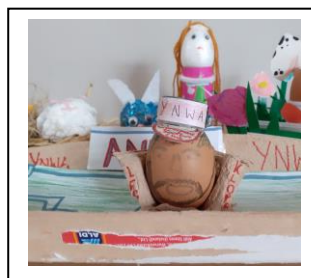
Winning Easter Eggs!